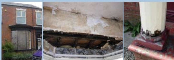
*Based on 1996 English House Condition Survey

The objective of the Good as New workshop is to look at issues that are specific to older properties, such as repair techniques which complement the design and construction of an old building, the legislative framework and the benefits of preserving historic character and local distinctiveness.